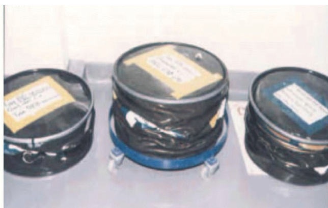
Figure 2-1. Supercompacted waste pucks as generated in the AMWTF (from Hansen et al. 2003b, Figure 2-1)

The 55-gallon drums of supercompacted waste would be compacted under a nominal pressure of about 60 MPa, which is considerably greater than the maximum compactive pressure of approximately 15 MPa exerted by halite creep at the WIPP repository (Hansen et al. 2003b, p. 23). As a result, the Department expects no additional compaction of this waste during repository creep closure. The presence of supercompacted waste would alter the time-dependent creep closure of waste rooms. The homogeneous waste model does not include the possible effects of spatially varying room closure or the specific mechanical or chemical characteristics of these supercompacted wastes.